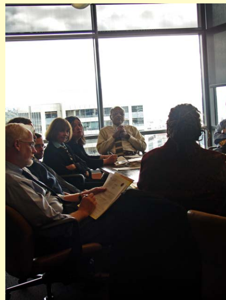
The Seattle Team in a planning meeting.