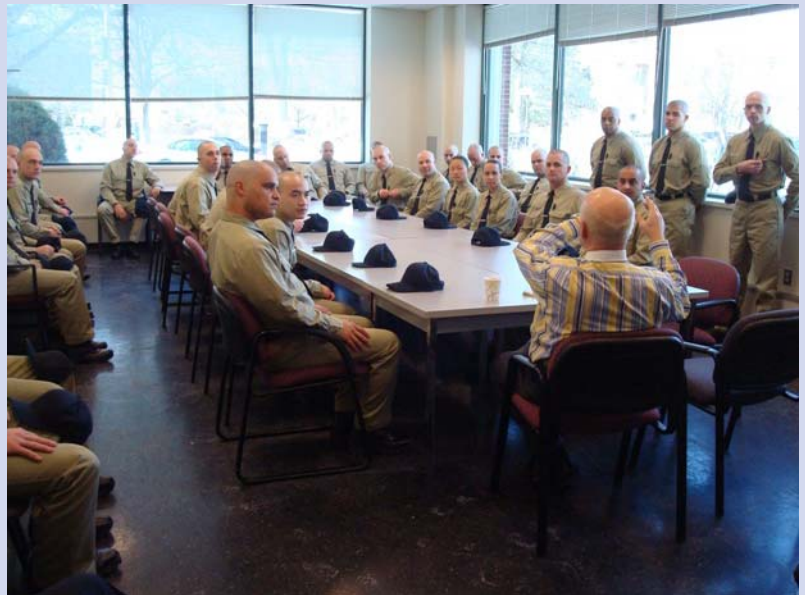
(Top) The Police Academy recruits in front of the Community Court (Bottom) The recruits meet with Judge Norko