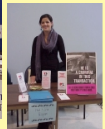
Paul & Lisa, Inc.