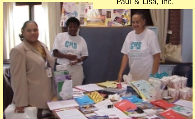
Community Health Services

Please feel free to email the court with questions or comments at: Hartford.Commcourt@jud.state.ct.us