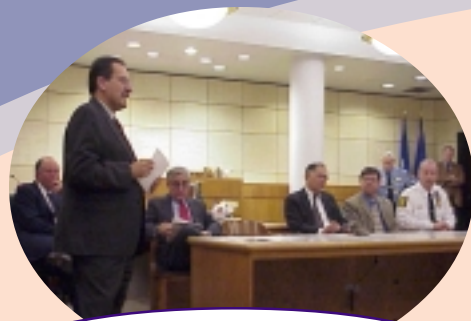
Mayor Perez' remarks